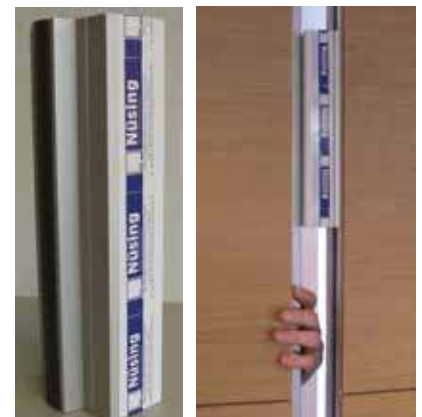
Pic. 2 - 3: left stopper, right stopper in use