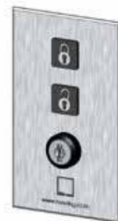
Pic. 6: control panel mode "zero/neutral position"