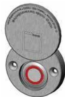
Pic. 12: Safety switch