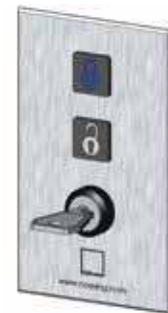
Pic. 4: control panel mode "close movable wall"

In this position (see pic. 6) the wall is deactivated and the key must be removed.