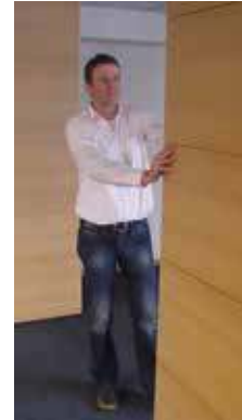
Pic. 1: Panel movement

Our movable walls don't need any maintenance! We recommend, however, an annual inspection by our service team.