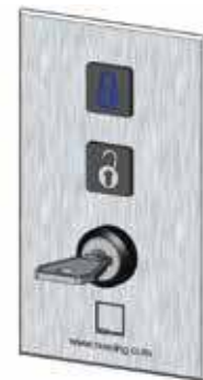
Pic. 11: Control panel mode "close movable wall"

Turn the control panel key to "neutral" and then remove the key. (see pic. 12).