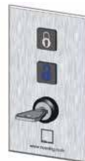
Pic. 5: control panel mode "open movable wall"