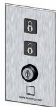
Pic. 13: Control panel mode "zero/neutral position"